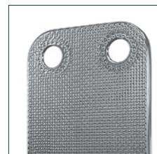
Innovative micro plate design