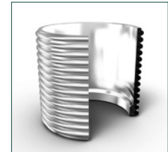
Flexible two-in-one connection