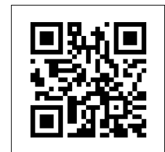
Scan QR code for more technical information and code numbers